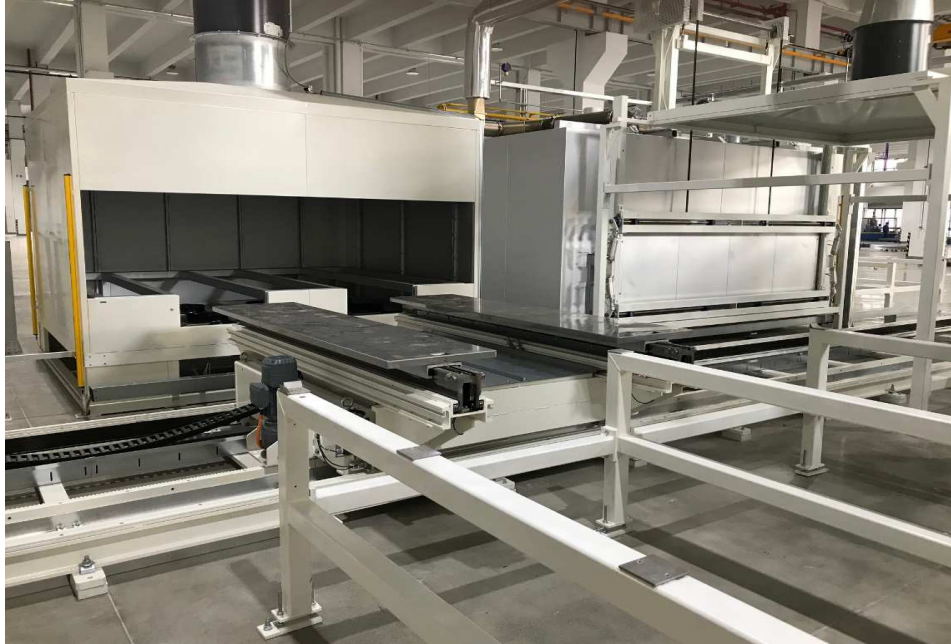
Cooling Zone (left)