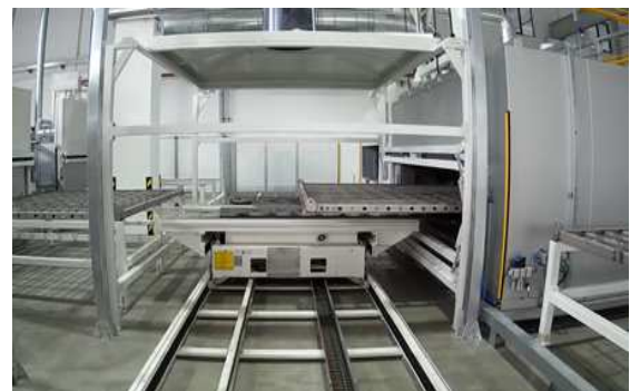
Loading / Unloading Shuttle